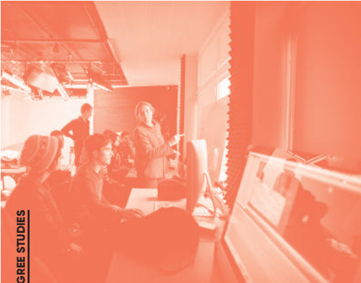
MASTER DEGREE STUDIES

The Historic and Cultural Heritage graduate program aims to prepare qualified specialists in heritage studies with broad inter-disciplinary competence in the fields of history, tourism, ethnology, and cultural anthropology. Graduates of the program are well-oriented in social processes, are familiar with the specifics of the cultural heritage of their region, are able to competently analyze the specific theoretical and practical issues, and to independently conduct research. Graduates work as researchers, teachers, tourism managers, analysts, experts, and consultants for the protection of cultural heritage and the promotion of harmonious ethnic relations.