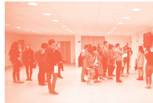
MASTER DEGREE STUDIES

The major is reflective of the situation of the University as a Belarusian project located in the Lithuanian capital but at the same time influencing the dynamics of the cultural sector in Belarus and well-equipped for educating professionals in the field of media and visual culture. The major comprises three basic areas of study: "The City and the Media" (covering forms of urban environment representation through history, visualizations and digitalizations of environment, virtualization of the city), "Transborder Urbanism" (covering the role of the cities and urban